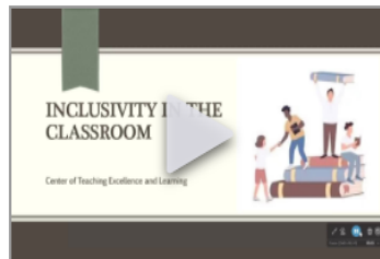
Inclusivity In The Classroom